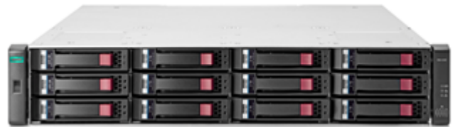
HPE MSA 2042 Storage (LFF)

The MSA 2042 further drives the MSA 2040 family into the world of flash acceleration with a new set of MSA models which includes 800GB of flash capacity in all SFF and LFF configurations. In addition to including 2x400GB Mixed Use SSDs in the base configuration, the MSA 2042 also includes a rich set of software features as standard including 512 Snapshots, Remote Replication and Performance Tiering capabilities, all at a very attractive price compared to other hybrid configurations. The 800GB of SSD capacity can be used as Read Cache or as a start to building a fully tiered configuration. With the inclusion of the Advanced Data Services SW License, customers can choose how to best utilize these SSDs to provide the optimal flash acceleration for their performance hungry applications. Both Read Cache and Performance Tiering utilize a real-time tiering algorithm which works without user intervention to place the most accessed data on the fastest medium at the right time. The MSA 2042 will dynamically move hot pages up to SSD for flash acceleration and move cooler, more stagnant data back down to spinning media as workloads change in real time hour-to-hour, day-to-day, and week-to-week. All done hands free and without any management overhead from the IT manager.