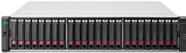
HPE MSA 2042 Storage (SFF)